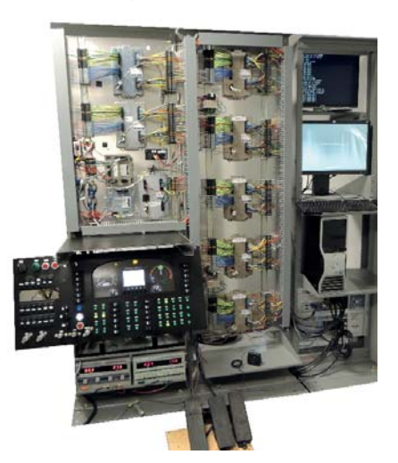
The new hardware-in-the-loop test bench

The bus's advanced battery system, featuring on-route, fast charging, consists of 8 packs, each with an individual pack level controller. A charge of less than 10 minutes provides the vehicle with